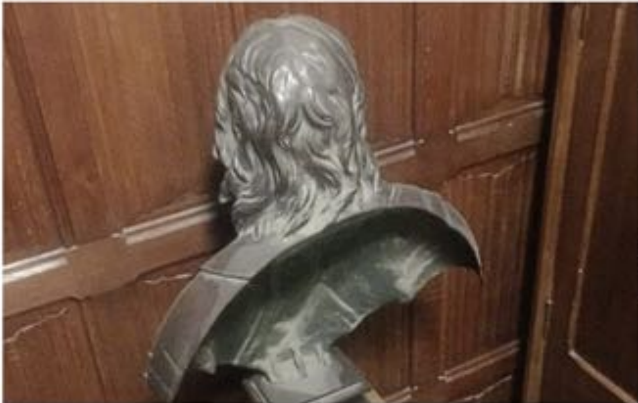
A historic bust of Cromwell was pointedly turned to face the wall.