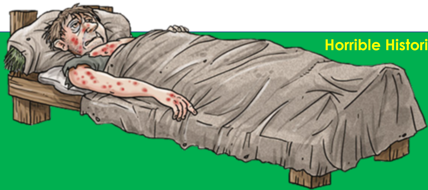
Horrible Histories Clip