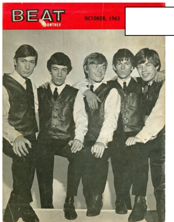
This music magazine cover features the Rolling Stones in their early days, 1963