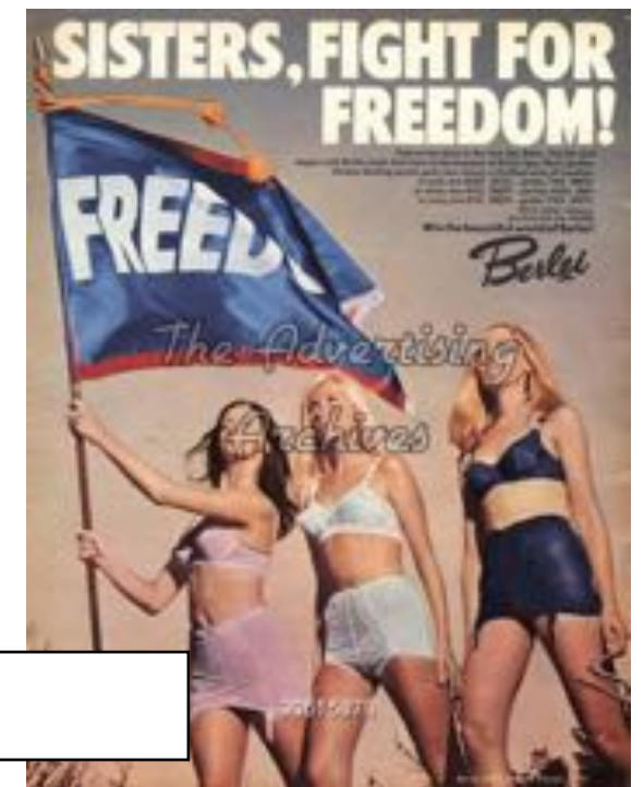
This advert for underwear in the 1960s includes the line: 'give your tummy a thrilling taste of freedom' by wearing a Berlei (brand) girdle.