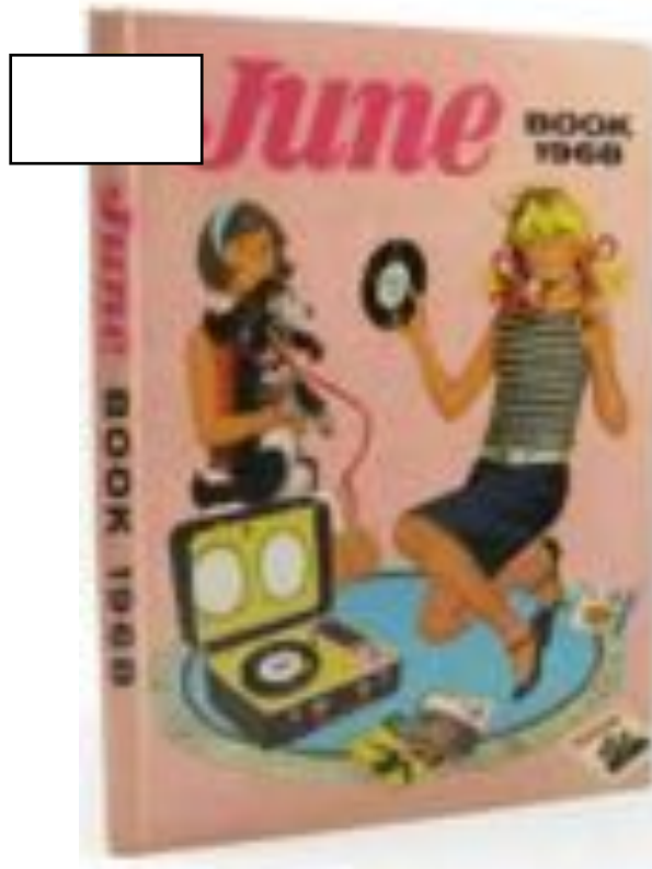
This is the cover of an annual for teenage girls from 1968