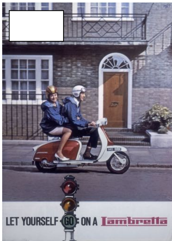
A Lambretta scooter. What does 'Let yourself go on a Lambretta' mean? Is there more than one meaning?